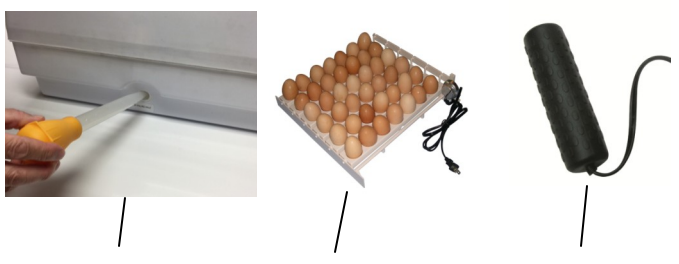
E-Z Fill Water Channel

An OPTIONAL Egg Candler (Model 3300) is sold separately and available so that embryos may be monitored during the process. We recommend candling 3 times during the incubation process— Day 7 or 10, day 14, and day 18. If you don't see anything at day 7 or day 10, do not discard those eggs immediately.