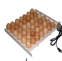
(Optional Model 3200) Automatic Egg Turner