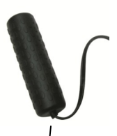
(Optional Model 3300) Egg Candler