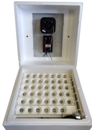
Image shown with OPTIONAL Model 3200 Egg Turner & Model 3150 Fan Kit

Remove the incubator from the packaging. The incubator comes in two parts (top and bottom). The BOTTOM of the incubator is the cover without the large observation window and power supply cord. The TOP of the incubator is the cover with the large observation window, power supply cord, heating element, and the LCD display panel with indicator lights. Plug both the power supply cord and the automatic egg turner power cord into a recommended GFCI outlet.