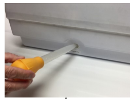
E-Z Fill Water Channel

An OPTIONAL Egg Candler (Model 3300) is sold separately and available so that embryos may be monitored during the process. We recommend candling 3 times during the incubation process— Day 7 or 10, day 14, and day 18. If you don't see anything at day 7 or day 10, do not discard those eggs immediately.